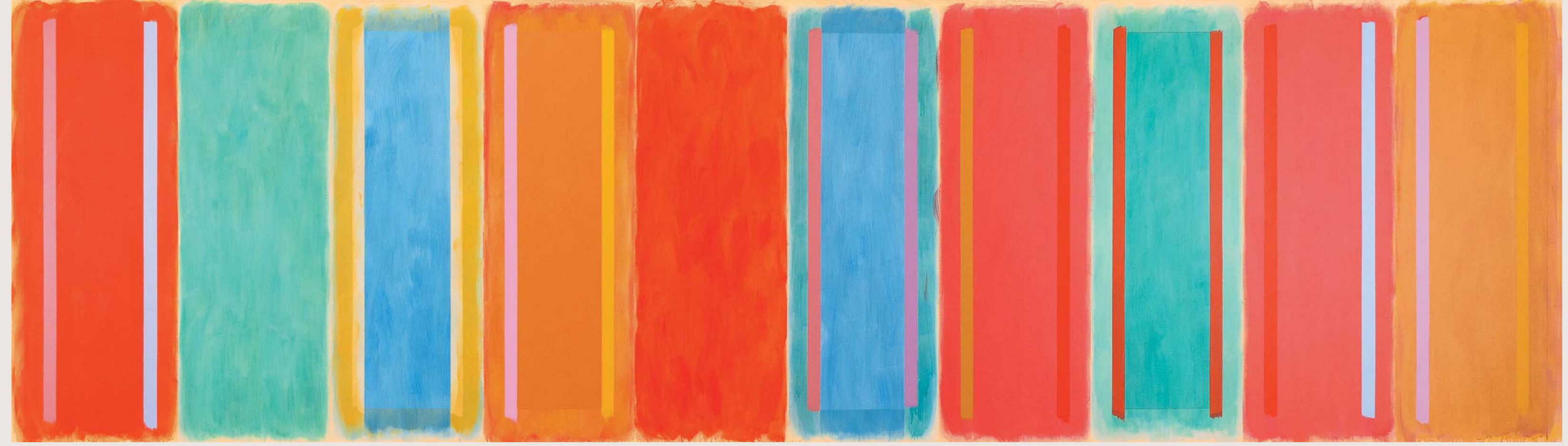
Rouisillon, 1997, Acrylic on Canvas, 72 x 254 inches